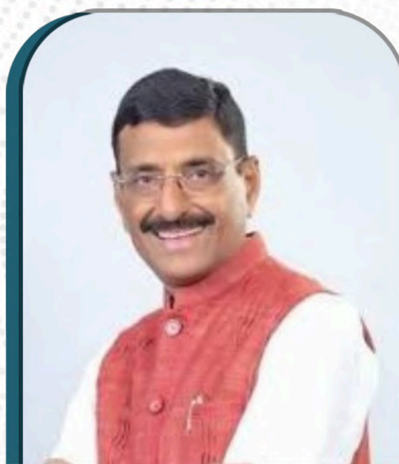
SHRI SANJAY SETH RAKSHA RAJYA MANTRI