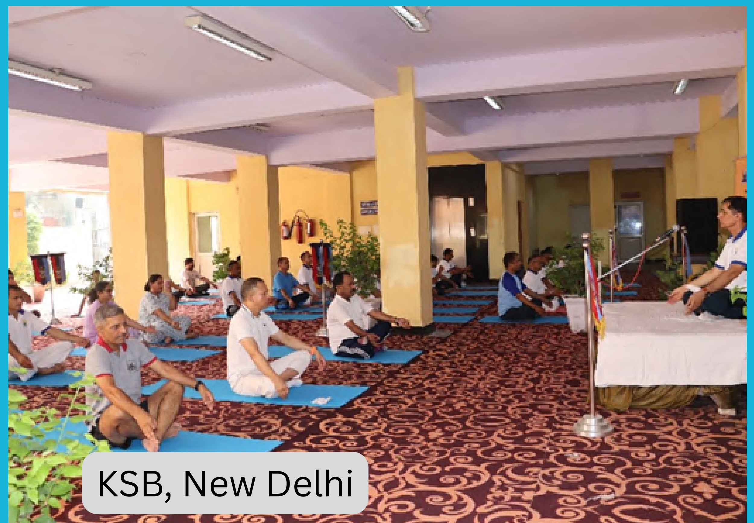
KSB, New Delhi

Few glimpses of Yoga Day event at Kendriya Sainik Board, Rajya Sainik Boards and Zila Sainik Boards.