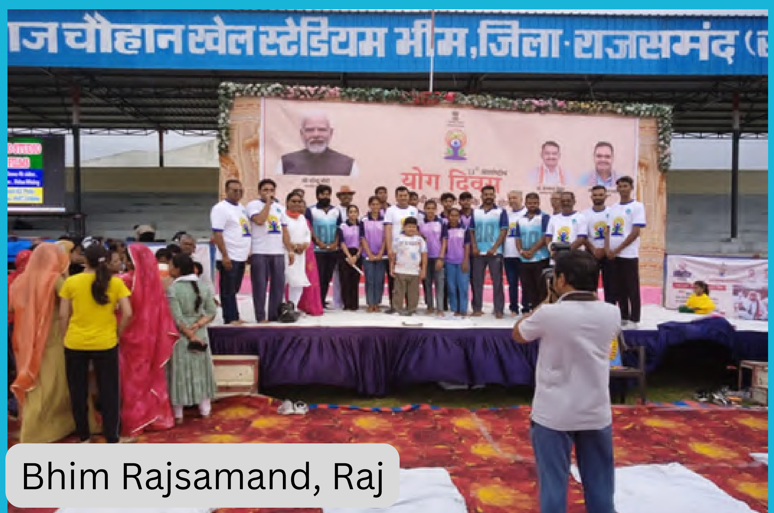
Bhim Rajsamand, Raj