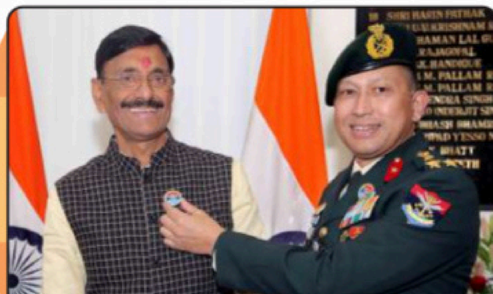
Hon'ble Minister of State for Defence Shri Sanjay Seth