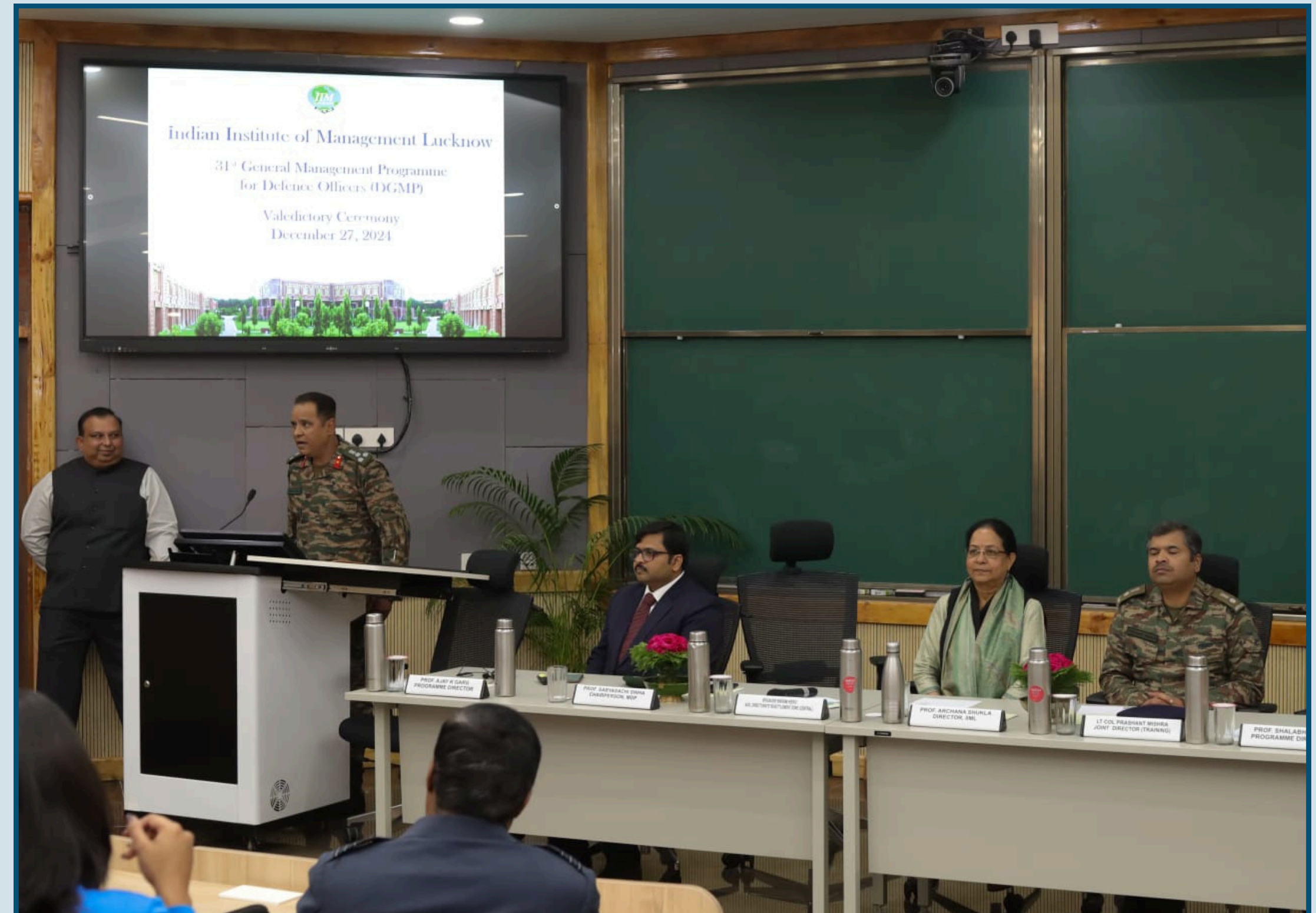
Valedictory Ceremony of DGR sponsored GMP-31 Course at IIM, Lucknow