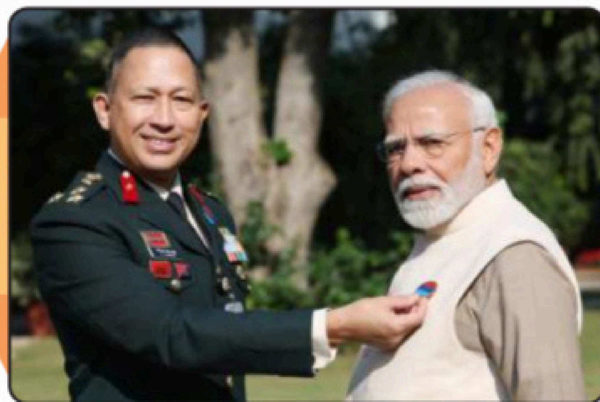
Hon'ble Prime Minister Shri Narendra Modi