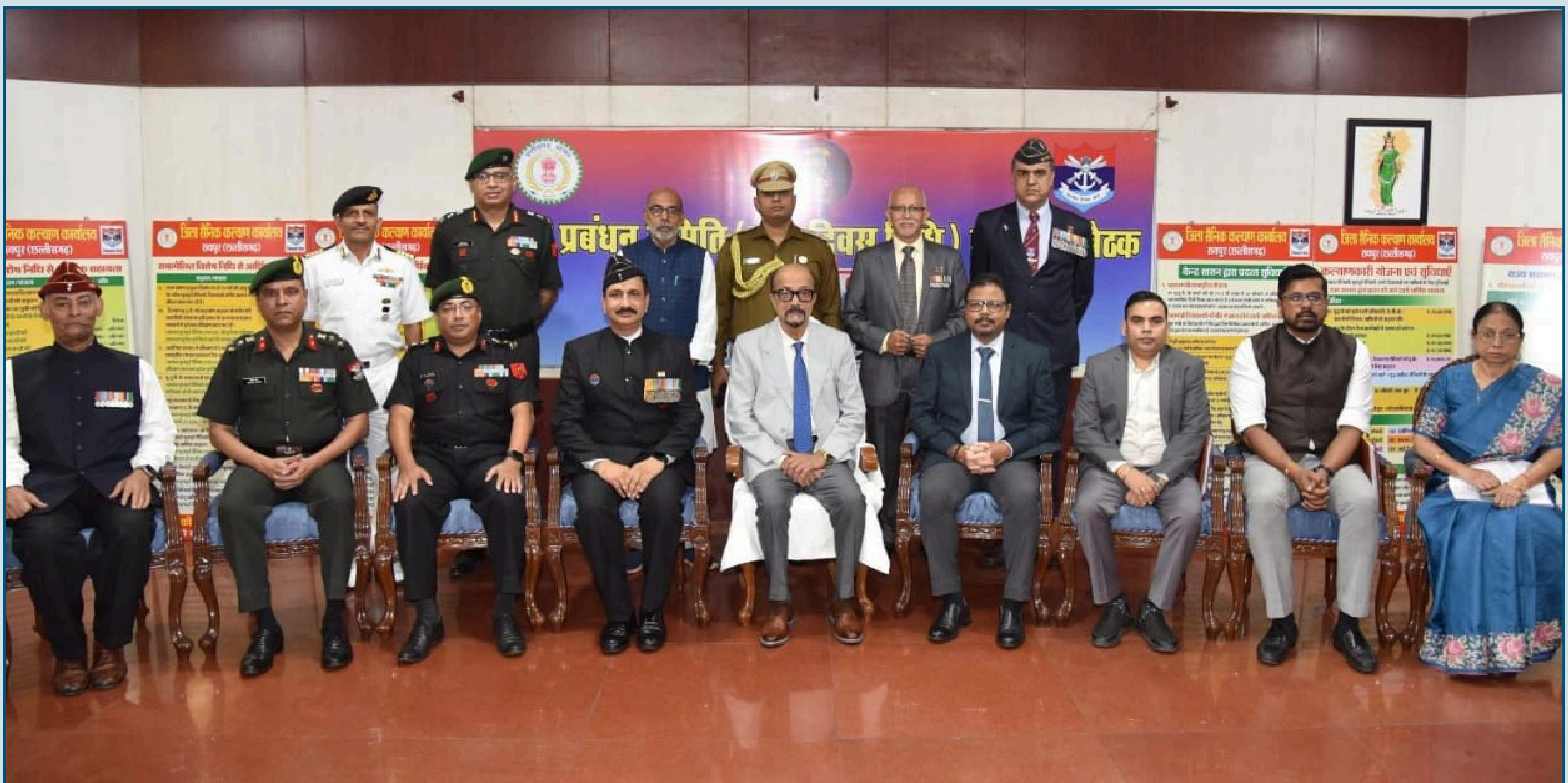
ADG, DRZ Central, attended the 16th State Managing Committee Meeting 2024 of Amalgamated Special Fund at Raj Bhawan presided over by Shri Ramen Deka, Honourable Governor of Chattisgarh.