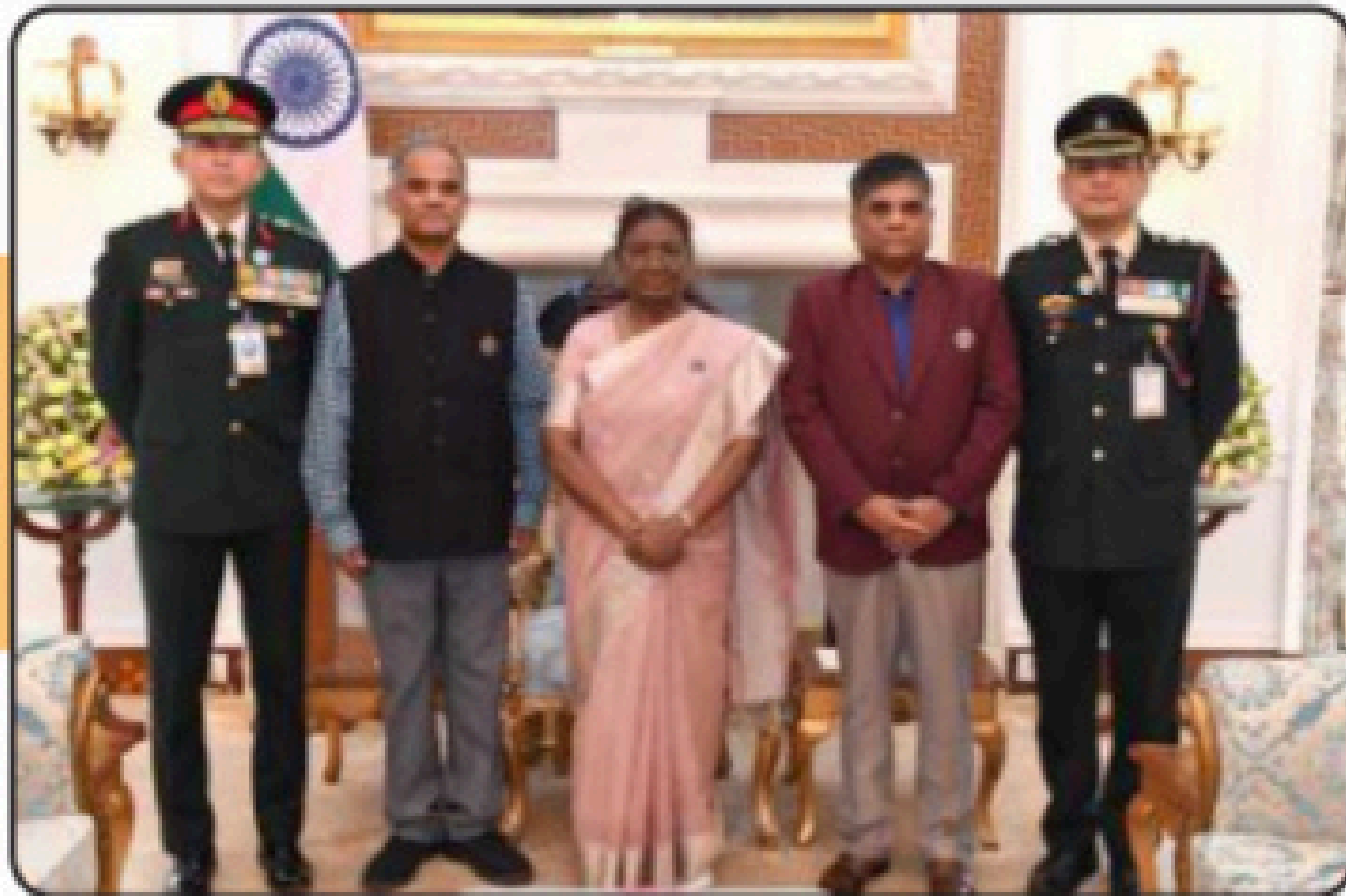
Hon'ble President Shrimati Droupadi Murmu