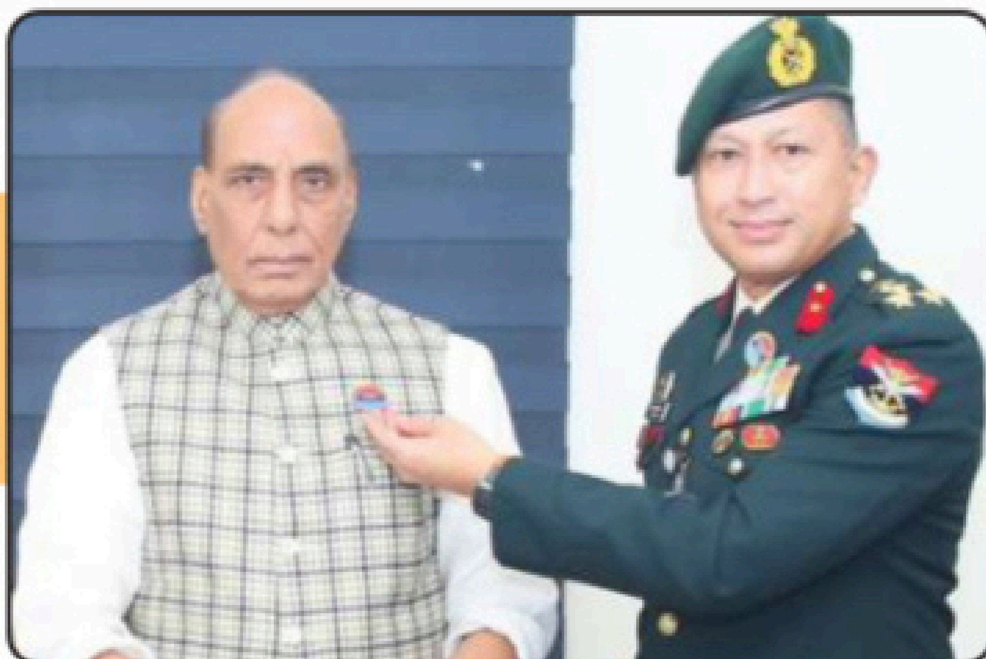
Hon'ble Defence Minister Shri Rajnath Singh