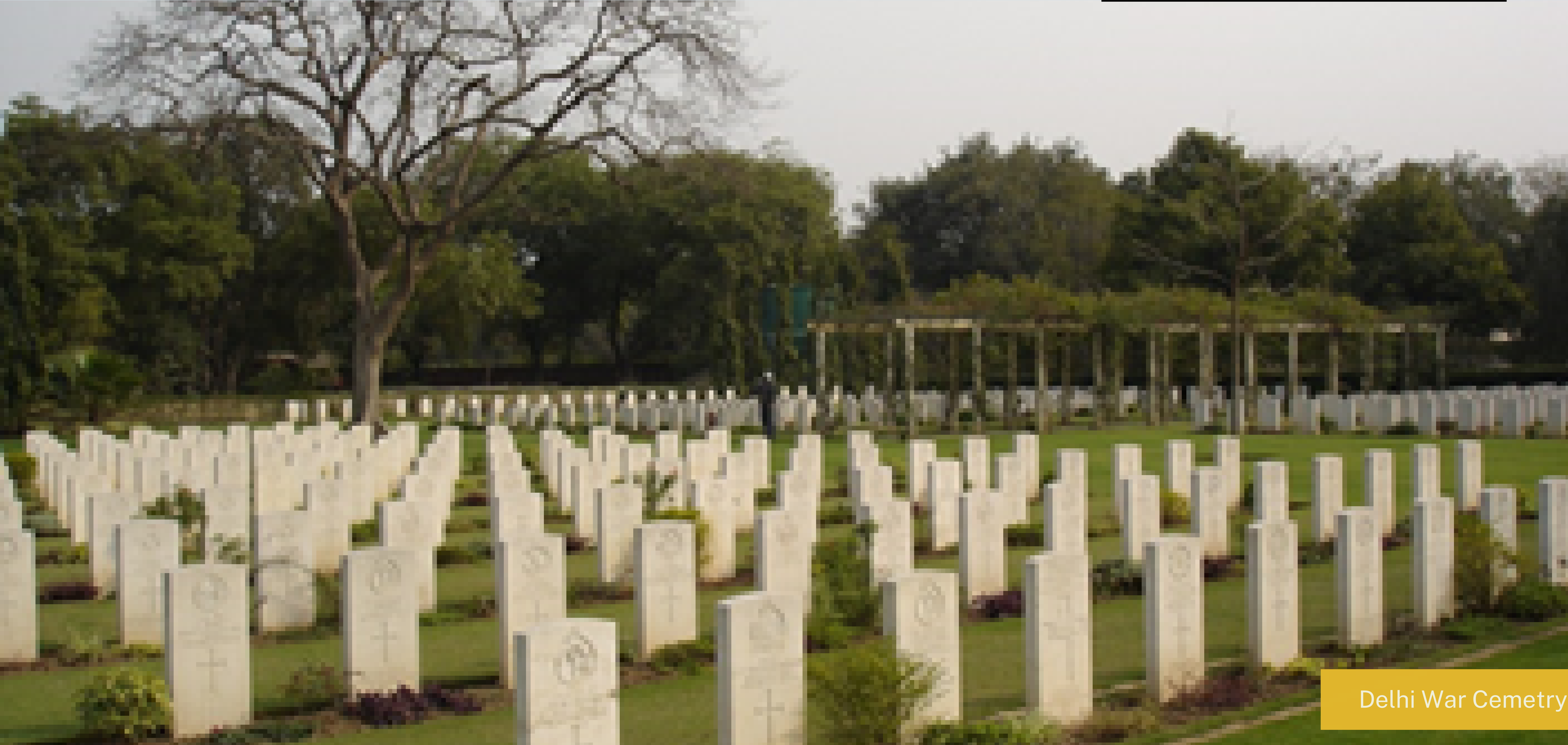
Delhi War Cemetery